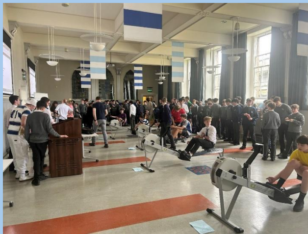
Second Years compete in the rowing energy competition during Environmental Action Week