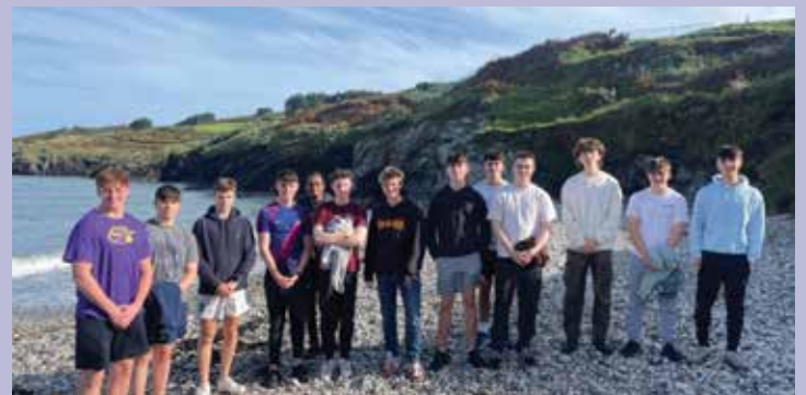
6th Year Retreats Wicklow