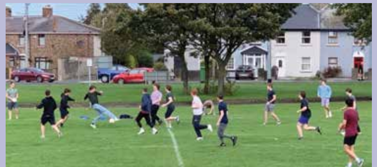
6th Year Retreats Balbriggan