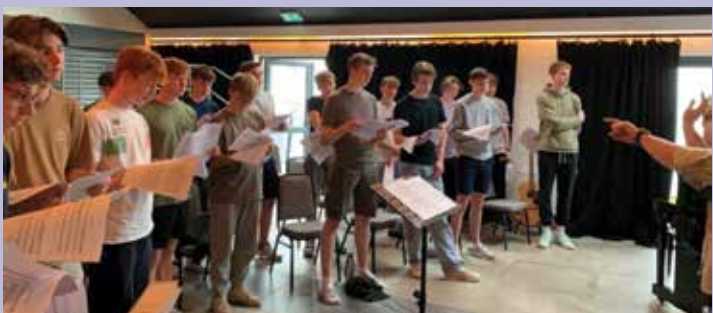
6th Year Retreats Balbriggan