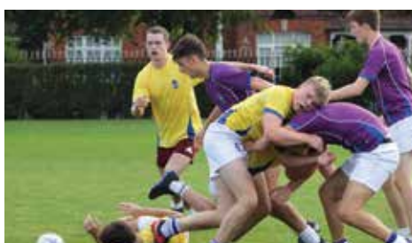
Fifth Years participating in September Rugby 10s Competitions