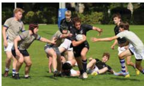
TJs participating in September Rugby 10s Competitions