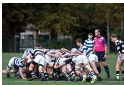
JCT V Pres Cork