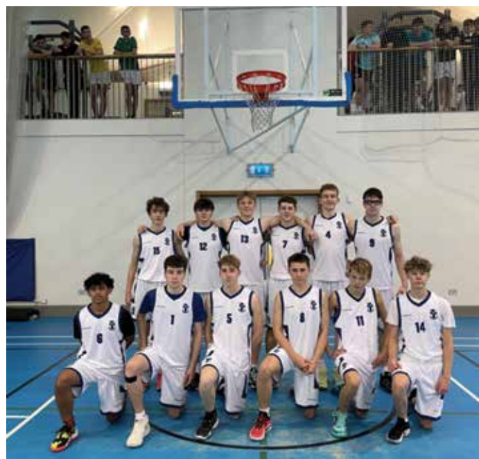
U19 Basketball Team