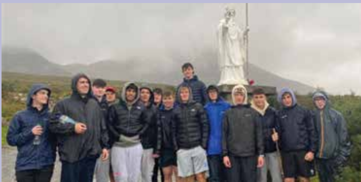
6th Year Retreats Ballintubber