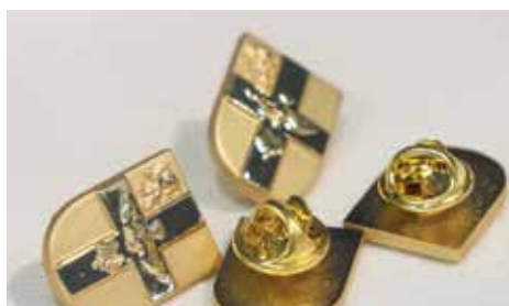
House Captain Badges awarded at the Commissioning of the House Captains at the Whole School Assembly