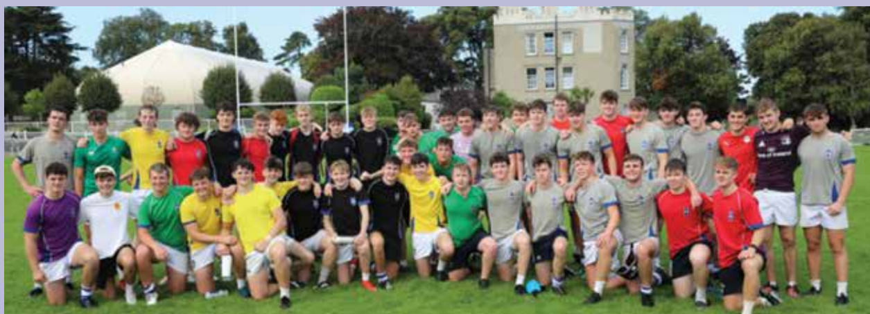
6th Year Group Photo House 10s