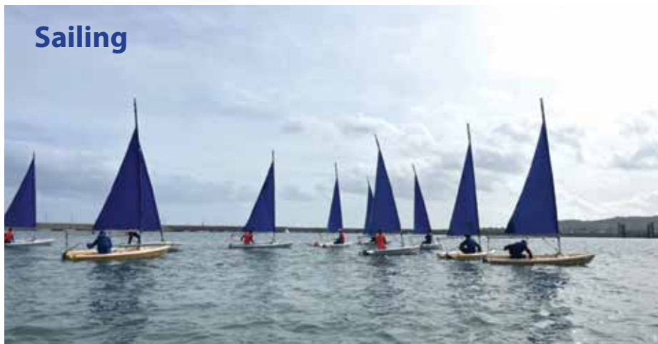
ABOVE: Blackrock College Sailing Regatta