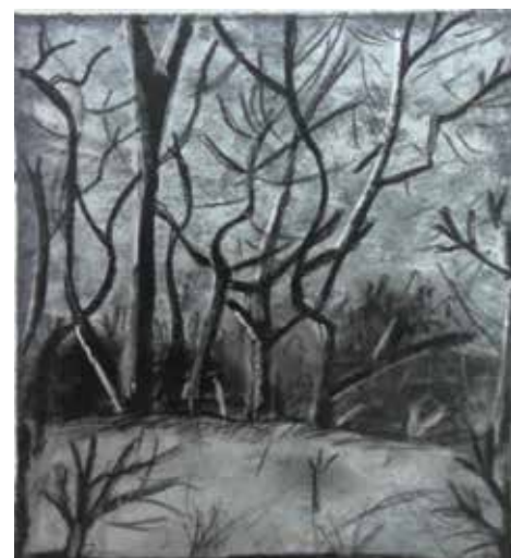
Illustration. Dylan Drumm