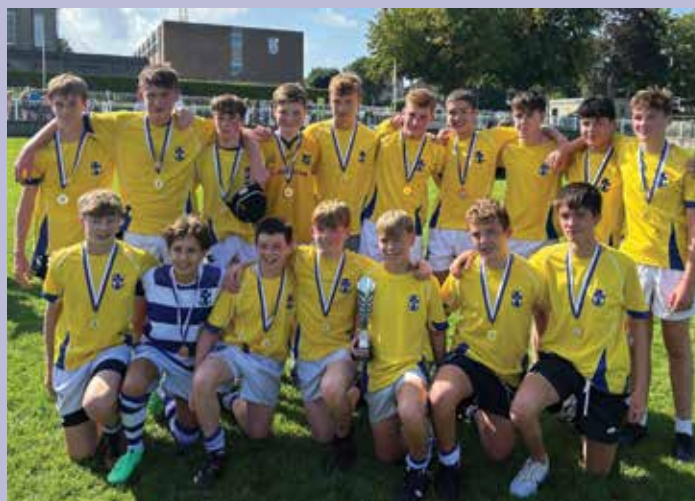
Third Year Duff House 10s