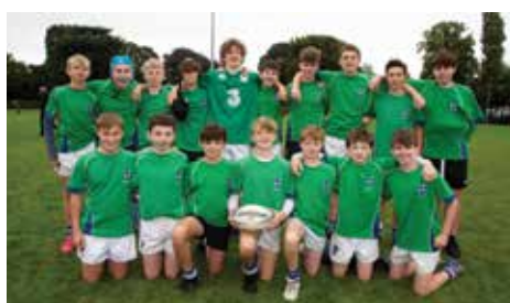
Second Year Brown House at the Rugby House Tens Tournament