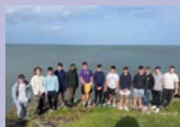
Some of the 3rd Years on Jersey Day

Congratulations to Fifth Year Browne House on their Swimming Gala victory.