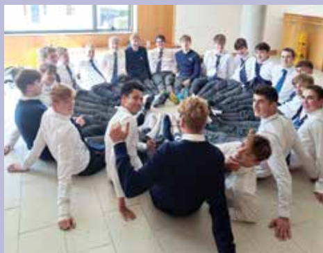
Fifth Years enjoying Odd Sock Day!