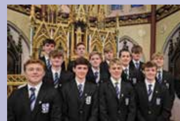
Fifth Year House Captain Commissioning

A stellar group of twelve young men leading and organising their peers with growing confidence. All have committed to confirming the College's position as a LIFT school and will complete their facilitator training over the coming weeks.