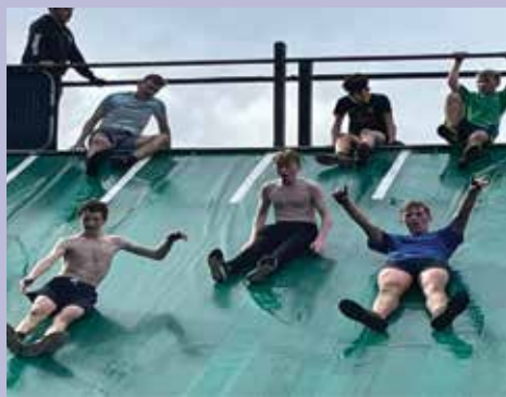
Transition Year Hell and Back Tour