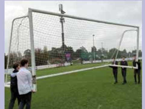
TY Students Weekly Assistance in Stradbroke Rugby Club