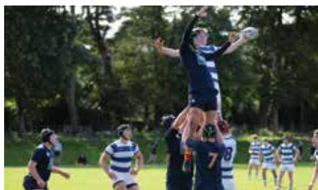
Blackrock V Temple Carraig