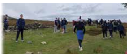
Castle boarders start out on the journey up Djouce.