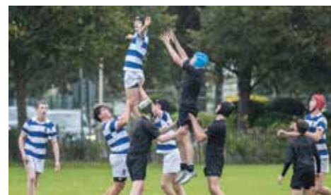
J 2nds Vs Campbell