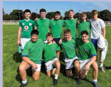
Third Year Browne House 10s