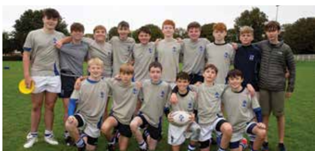
Second Year Shanahan House at the Rugby House Tens Tournament