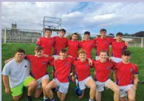
Fifth Year Rugby 10s Winners – DeValera.

Appointments are made for Fifth Year students for Career Guidance and Counselling . Students are encouraged to request appointments as often as required.