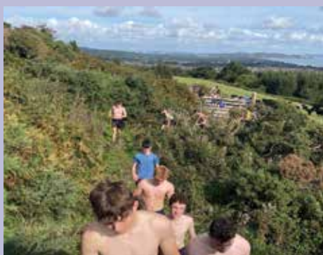
Transition Year Hell and Back Tour