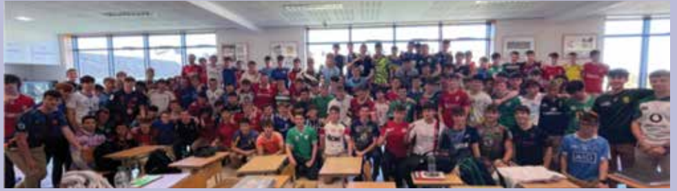
6th Years on Jersey Day