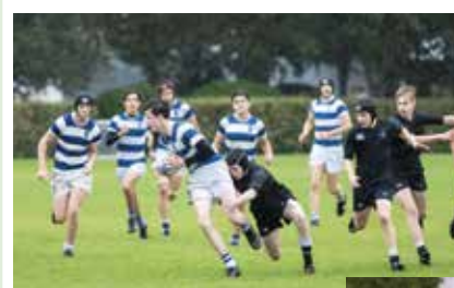
Blackrock J 2nds Vs Campbell