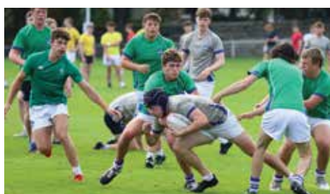
Sixth Years participating in September Rugby 10s Competitions