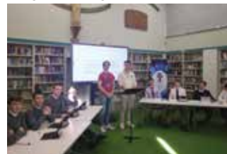
Junior v Senior Debate

We look forward to the Teacher vs Student Debate, which will take place during Science Week in November, as well as friendlies with our neighbouring schools.