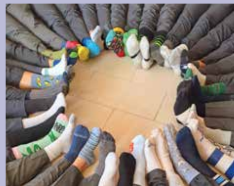
Fifth Year Odd Socks!