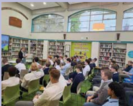
Fifth and Sixth Year exploring Third Level opportunities in the USA