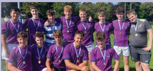
Transition Year Rugby 10s Winners Ebenecht