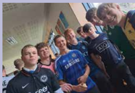
Fifth Years enjoying Jersey Day in aid of IMNDA