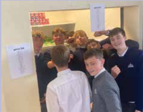
TY Tuck Shop open for Business!