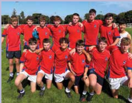
DeValera House 10s