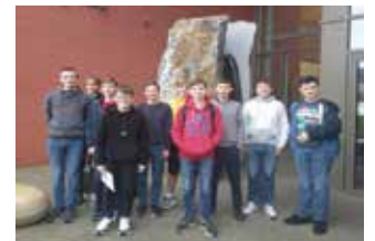
Junior MACE in Clonkeen College