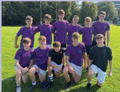
Third Year Ebenrecht House 10s