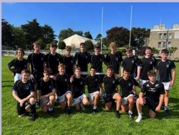
Leman House 10s