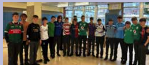
Some of the 3rd Years on Jersey Day