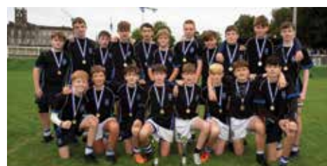
Second Year Leman House at the Rugby House Tens Tournament