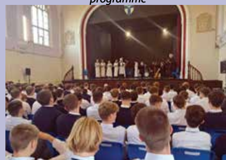
Fifth Years attending an Emily Dickinson play in the Jubilee Hall.