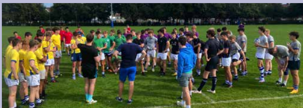
Transition Year Rugby 10s