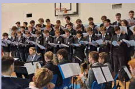
Fifth- and Sixth-Year Choir and Orchestra at the Whole School Assembly.