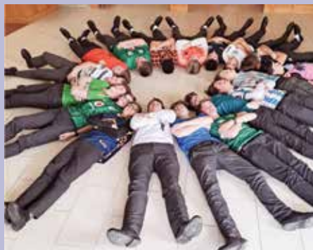
Fifth Year Jersey Day!