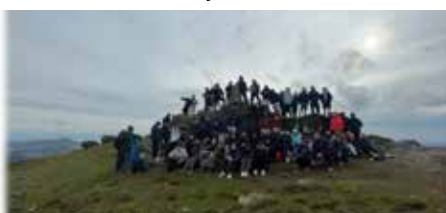
Castle Boarders make it to the top of the mountain.