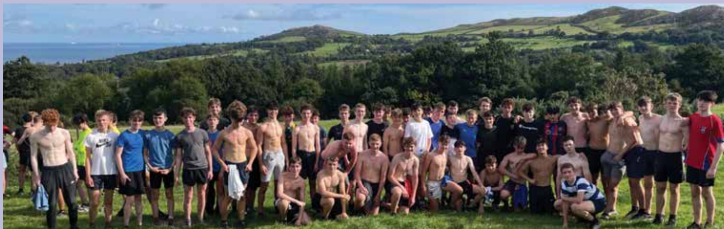
Transition Year Hell and Back Tour