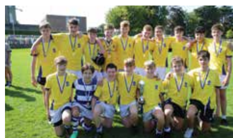
Third Year Duff House participating in September Rugby 10s Competitions