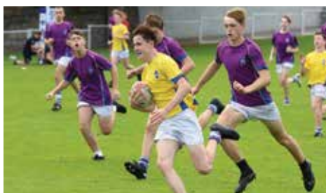
Third Years participating in September Rugby 10s Competitions