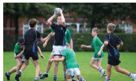
Members of Leman House and Brown House at the second Year House 10s Rugby