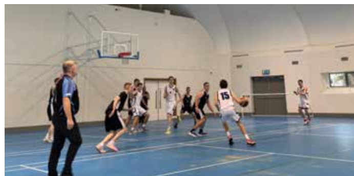
U19 Basketball Team