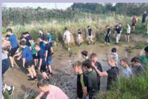
Transition Year Hell and Back Tour