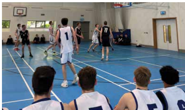
U19 A League Playoff Match Versus Malahide CC