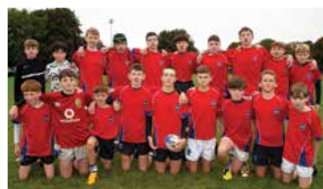
Second Year De Valera House at the Rugby House Tens Tournament