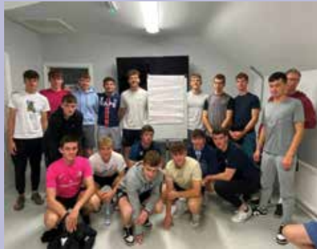
6th Year Retreats Cootehill