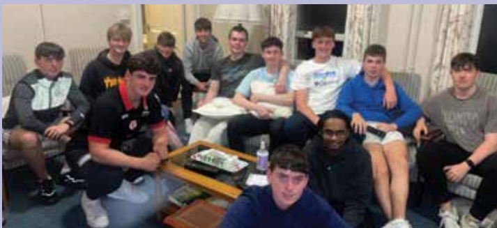
6th Year Retreats Wicklow