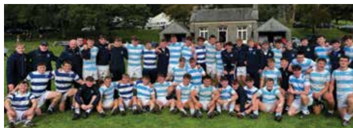
SCT and Senior 2nds after two victories in Sedbergh

Back in school, the squad has started the new season well with wins over Newbridge, Castleknock, Campbell, Terenure and Sedbergh (UK). The seconds have matched this achievement with wins of their own against Campbell, Terenure and Sedbergh also. Defeat for both sides to Gonzaga before that run of victories, however, keeps everyone's feet firmly on the ground as they work hard right up to midterm and into the demanding schedule that awaits the far side.