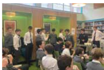
Climate Cafe Presentation

During Environmental Awareness we held our first Climate Café, which was a