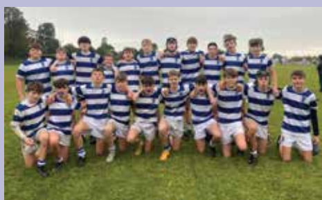
Under 14 C Rugby team after their win against St. Michael's.