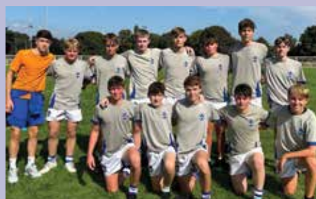
Third Year Shanahan House 10s