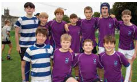
Second Year Ebenrecht House at the Rugby House Tens Tournament