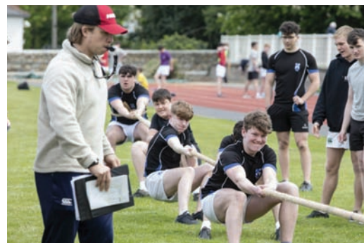
Fifth Years on Sports Day