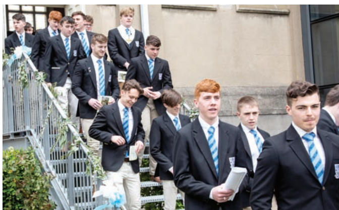
Sixth Years on Graduation Day