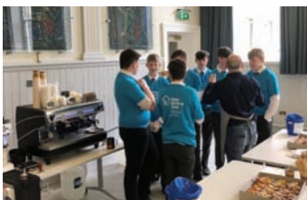
TY Baristas host the Coffee Morning

Though this summer term has been shorter than normal at five weeks, Transition Years have managed to pack a lot into it; especially considering there was a week of work experience added into it as well! As well as what you will read below we have had a First Aid Course, another Conversational French evening course and the Parents' Coffee morning on 3rd May hosted by the expertly trained TY Baristas!