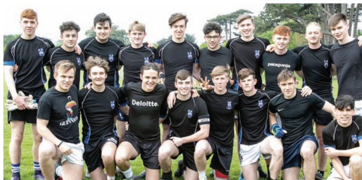
Leman House Team (Winners of the Sixth Year Soccer Final)