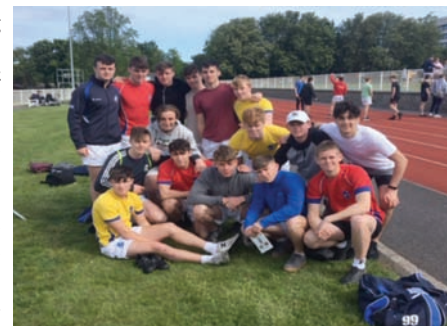
Fifth Years soaking up the atmosphere at Sports and Family Day