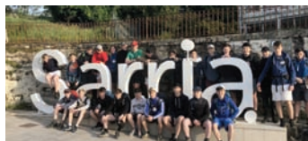
TYs on the Camino de Santiago Trip