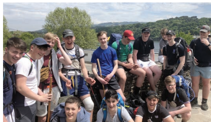
TY students on the Camino de Santiago