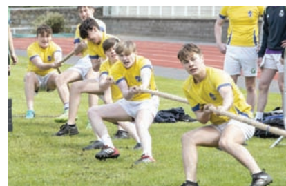
Fourth Years on Sports Day