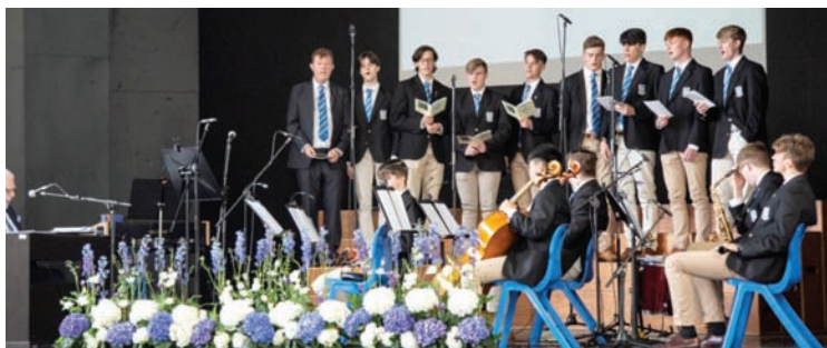
Sixth Years singing 'Bridge over Troubled Water' at the Graduation Mass

The Union Retreat took place on Holy Thursday and Good Friday and we would like to thank the members of the Adult Choir and Past Pupils who took part in these liturgies and sang. We finished up with the Easter Vigil which is always very atmospheric as the chanting and singing begins at the Paschal flame in the Quad before processing to the Chapel.