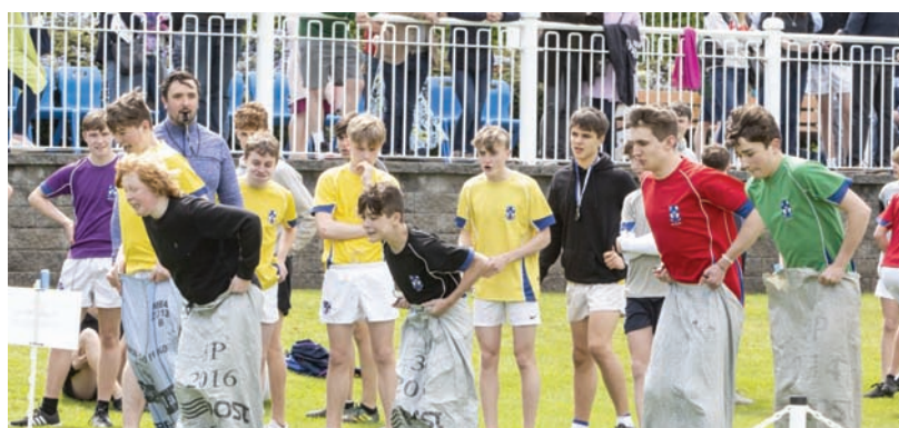
Second Years enjoying the Sack Race on Sports Day