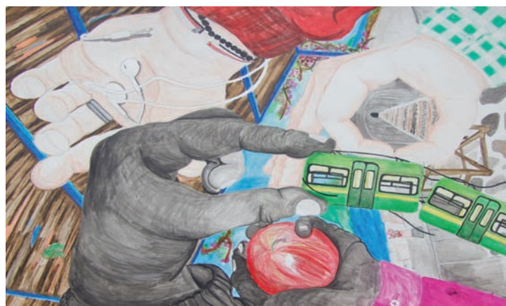
Joe Byron (Sixth Year) illustration