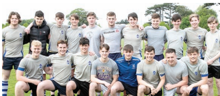
Shanahan House Runners-up