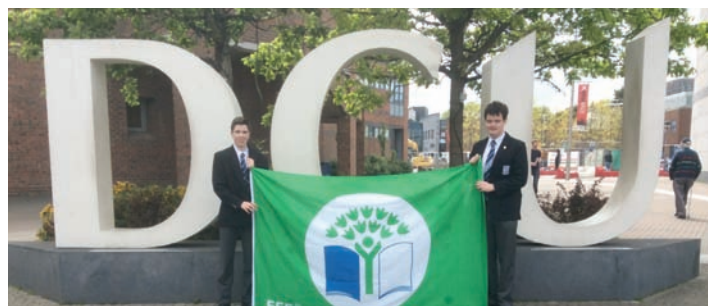
Blackrock College Green Schools at DCU