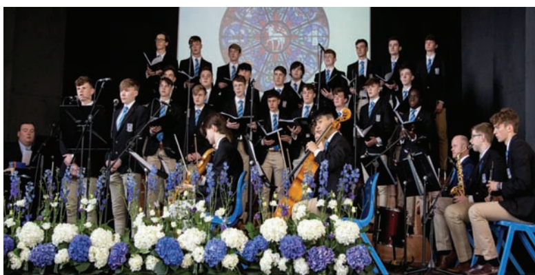
The Choir and Orchestra at the 6th Year Graduation Mass