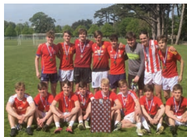
Stanley Cup Winners- Castle Dayboys