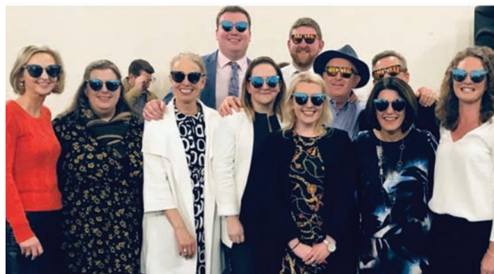
The Staff Choir at the Summer Concert