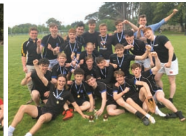
6th Year Soccer Final (Leman House)