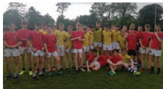
Duff House V de Valera House in the Final of the Soccer League