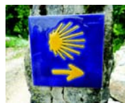
6th Year Graduation – Be Grateful

week. The group bonded very well, supporting and encouraging each other during sometimes wet weather ... to Be There for each other and themselves.