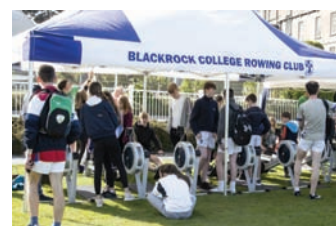
The Rowing Tent proved a hit as always during Sports Day