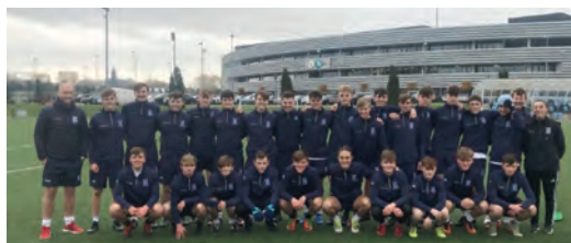
Soccer Squad after training at the Manchester City training grounds

to a 3-1 victory. One of the highlights of the trip was the training session held in Manchester City's training ground.