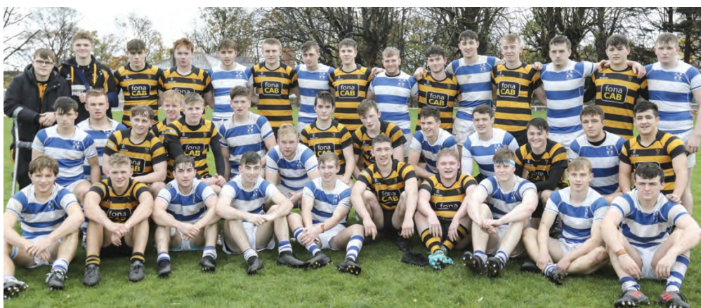
Rock V RBAI