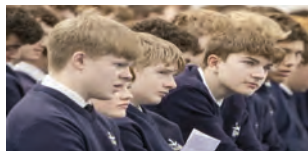
TYS at the Carol Service

It has been a hugely busy first term in Transition Year. November and December are busy months in TY to say the least, but they are great months with such fantastic opportunities for the students to mature, develop new skills and challenge themselves in ways that just a few short months ago they wouldn't have even considered! TY is a constant challenge to develop an "opt-in" attitude to the many opportunities that are in front of the boys. I would encourage all students to use the holidays as a time to reflect on their TY experience thus far. Have they been making the most of the many opportunities available to them? Are they involved? Are they participating in the extracurricular programme? If the answer to these questions is yes then the challenge is to continue to develop and strengthen that desire to get involved and maximise opportunities. If the answer is no or a 'qualified yes' then I put it to the students that it is entirely within their control to define their TY experience in a hugely positive way with all that is on offer in the New Year. I also encourage the students to think back on the tangible differences they have made to people's lives. Be it through volunteering with Gaisce, the clients they meet on Pastoral Placement, the various charity collections or their part in the Saint Vincent De Paul Christmas appeal; all students have demonstrated that we individually and collectively have the capacity to make a difference to those around us.