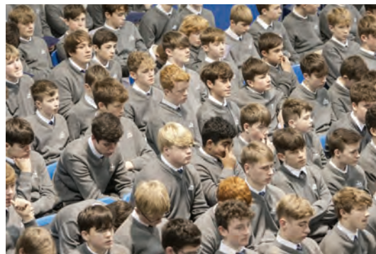
Third Years at the Carol Service