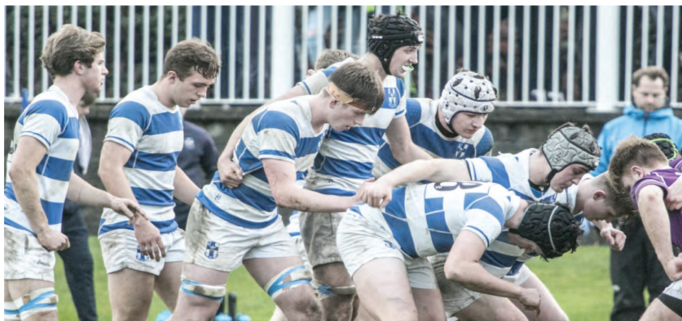
Rock V Clongowes