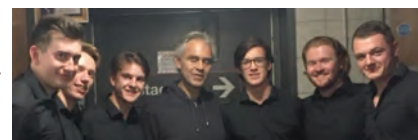
Past Pupils perform with Andrea Bocelli

Another strong connection we have is with our past pupils and we were delighted to welcome back the Past Pupils' Choir to sing at the Mass of Remembrance in the College Chapel at the end of November. "Music expresses that which cannot be put into words and that which cannot remain silent".