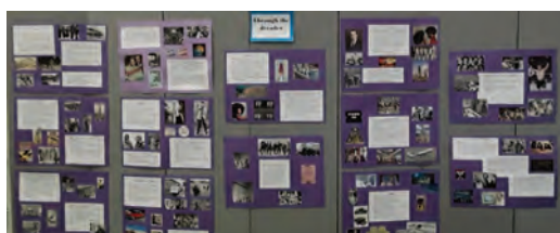
A Year of Change Exhibition

The exhibition gave the students not only the opportunity to hone valuable research skills, but also experience in planning and curating an exhibition.