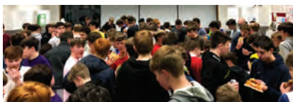
Pizzas devoured in the Home Economics Room after 15 hours of play !!

The games were played in a very competitive and hugely entertaining manner. The Soccer Marathon Committee used different coloured plain t-shirts to distinguish between the teams, however there was a significant amount of creativity that then