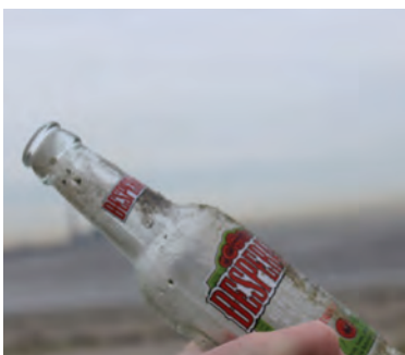
on the Beach Clean. Well done boys!