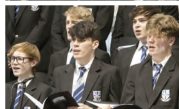
The Choir perform at the Carol Service

Another strong connection we have is with our past pupils and we were delighted to welcome back the Past Pupils' Choir to sing at the Mass of Remembrance in the College Chapel at the end of November. "Music expresses that which cannot be put into words and that which cannot remain silent".