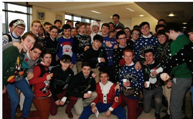
Christmas Jumper Day

The Sixth year Parent Teacher meeting will be held from 4:15pm until 6:45pm on Thursday 8th of January. We look forward to seeing you there.