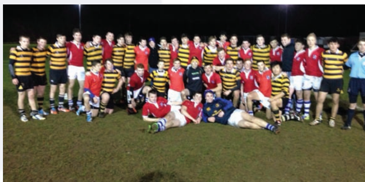
TY rugby development squad with students of RBAI on annual tour to Belfast

Finally a reminder that the transition year parents' social will take place in the school on Friday the 30th of January – see you all there!