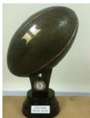
2nd Year Rugby Blitz Trophy