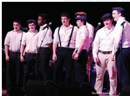
Boarders' Choir at the Leman Concert

The following activities are taking place throughout each week: TEFL class for foreign students; public speaking and debating; Wednesday evening Mass in the Oratory; Boarders' Choir; Boarders' Book Club and Boarders' Cookery Classes for 5th and 6th years. Thanks to all the adults who help organise and oversee the continued success of these activities.