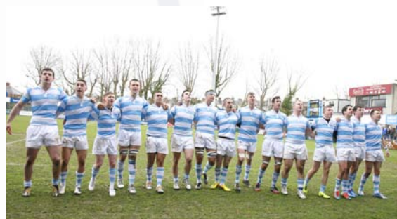
SCT Squad 2014

Since the Christmas period the Senior Team has played four fixtures. Victories over Munchin's, Methody and CBC Cork completed the preparation phase prior to the first cup match against CBC Monkstown. The team played CBC on the 4th of February following two postponements due to the inclement weather. A hard physical encounter saw the team emerge victorious on a score line of 31 points to 3, with plenty of scope for improvement.