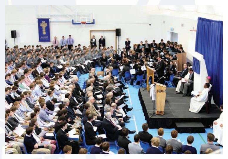
The Opening and Blessing of the New Sports Hall by the Papal Nuncio

The Cross Country Teams competed in their first event of the new season at The Clonliffe Harriers AC and Brothers Invitational held in Santry. The teams performed extremely well and showed a lot of promise for the up and coming season. Aside from a depleted Junior Cross- Country Team which finished in 6th place, a very strong Intermediate Team finished in a well deserved 1st place, whilst the Senior Team also did very well finishing 3rd in a very tight- scoring race.