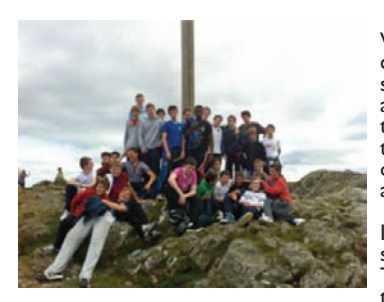
Boarders on Bray Head

Over the past half- term, the boarders have attended their own retreat in All Hallows College in Drumcondra, have made trips to Trinity College Science Gallery, walked Bray Head, visited the Book of Kells, the Marconi Museum in Howth, The National Art Gallery and Dublin Zoo. Also, they have had a number of excursions to the cinema, bowling alley, and City Centre shopping.