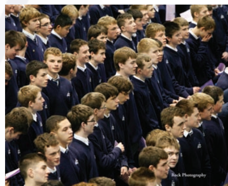
Christmas Carol Service 2013

I would like to congratulate the Arch Club on celebrating its tenth anniversary recently. The club does tremendous work and was recently honoured by DLRCC. Quite a few boys from TY do their Gaisce community service with the Arch Club and have been enriched enormously by this experience.