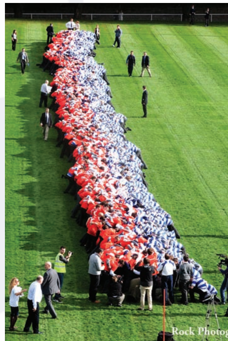
World's Largest Scrum, 25th Oct. 2013