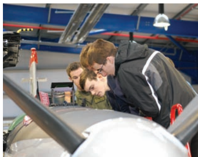
TY Science visit to Baldonnell airport