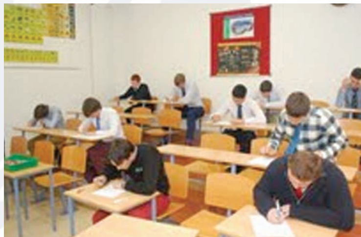
Annual Science Quiz for 5th & 6th Years

We send our very best wishes to both our Senior Quiz teams and Young Scientist competitors for success in their endeavours.