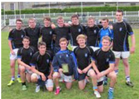
Winners of Leman House Rugby 10s