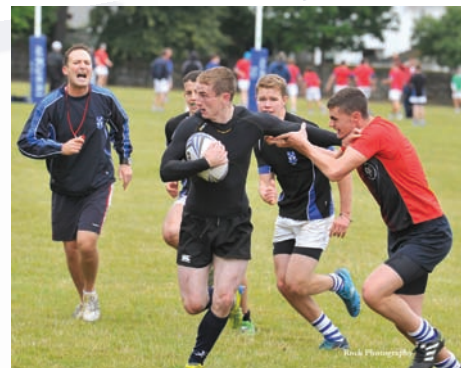
10 a-side Rugby Tournament

O'Reilly) and McQuaid (Max Airey) were from different Houses. All in all it was a wonderful occasion and we congratulate everyone for the commitment shown to their respective houses. The following weekend the 2nd year competition took place with Hugh O'Leary captaining Duff to victory.