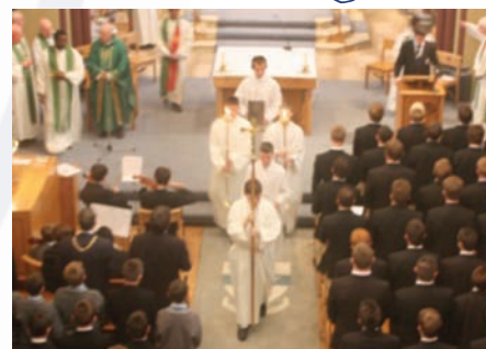
Boarders' Family Mass