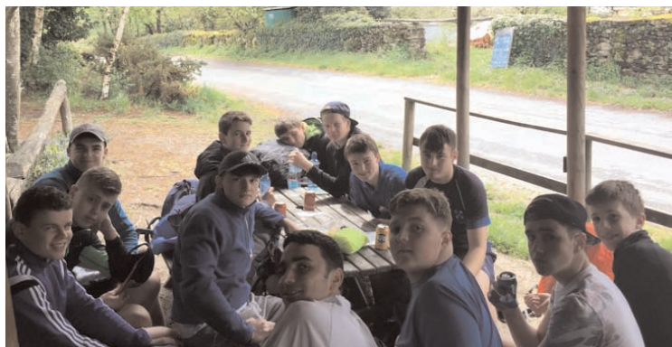
Students take a well-earned rest mid-way between Sarria and Portomario on the Camino