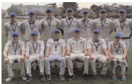
Senior Cricket Team