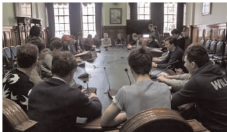
Students at the City Hall in Belfast