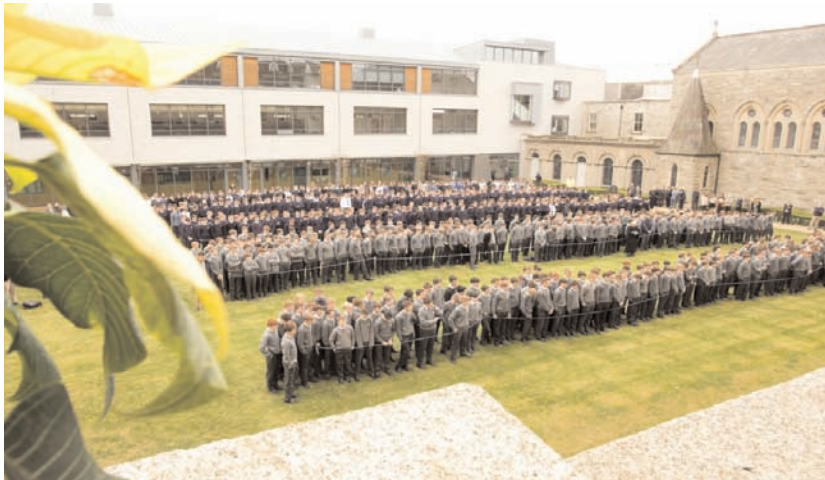
The whole school assembled in the quadrangle to Remember the Rising