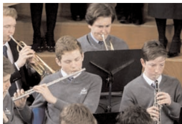
The Orchestra at the Summer Concert

The Graduation Mass was a deeply moving liturgy, appreciated by the boys and their parents. The combined efforts of the Sixth Year Choir and Orchestra enhanced the liturgy with their uplifting hymns and instrumental performances. It was a liturgy that marked the end of their time with us in the College, and one that they will always cherish and remember. We thank them, applaud them for their generous contributions to music in the college, and wish them well on the road ahead.