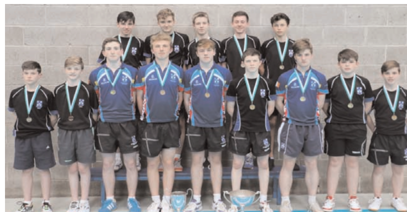
Blackrock College junior and senior Table Tennis squads Leinster Cup Champions 2016