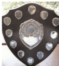
The Barry Shield

As the final term wound its long way along, the Second Year boys became more and more involved in extra-curricular activities; and what opportunities they had. Many were involved in the Junior Musical Oliver Twisted on the stage, back stage and in the orchestra. This was a wonderful production with Loreto Dalkey and congratulations to all involved. The House Competitions finally ended with the Soccer League, Debating and Sports Day being the final contributing events. As a result, the Second Year Inter-House Barry Shield was won by Shanahan House. Second Year boys also performed well in Schools and Inter-Schools competitions in Golf, Cross-country, Debating, Water Polo, Rowing, Athletics, SciFest, Cycling, Music, Choir and with the Willow Wheelers. Special mention to our Table Tennis players who are once again Junior Irish Champions and to our medal winners at the Irish Schools' Swimming Relay Finals.