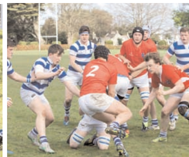
Castle versus House Final

We congratulate the Second and Third House Squads and thank them all for two memorable games and great results against the Castle teams in the finals of the Leinster Schools' Leagues soon after Easter. We wish them and all this year's House Rugby players the best for next year.