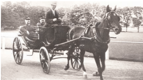
The College horse on a happier occasion