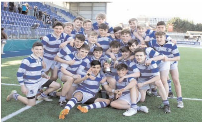
Blackrock versus Mount Temple JCT, Junior 4ths Final in Donnybrook