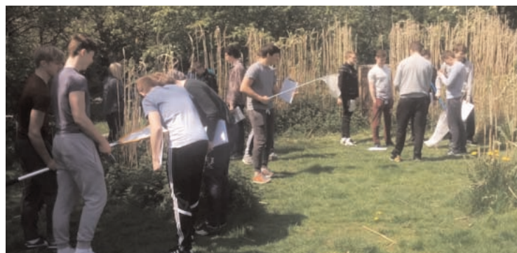
Fifth Years in Airfield Estate, in Dundrum

On Friday May 13th, 120 Fifth Year Biology and Agricultural Science students accompanied by five Blackrock College Science teachers took part in an ecological survey of the flora and fauna of the grassland habitat at the Airfield Estate, in Dundrum. An enjoyable educational day was had by all in glorious sunshine.