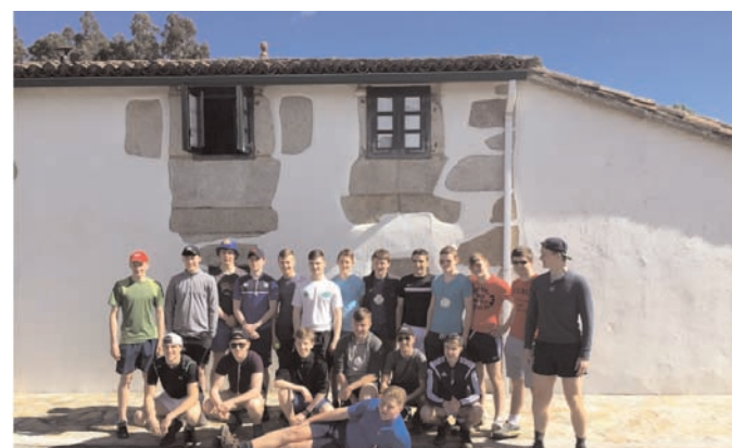
The sun shone on Day 3 of the Camino Trip as the Transition Year students walked 26 km to Palas de Rei.