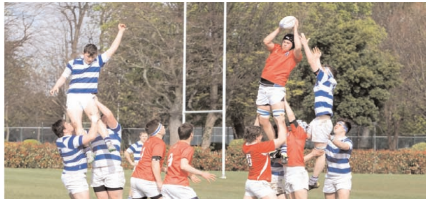
Castle versus House Final