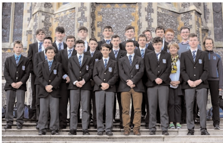
Blackrock College Swim Team before the annual swim meet against Harrow

The team were amazing and were up against many swimmers who are on the Irish National Team. All in all this term has been full of great achievements with a huge amount of personal best times and each time representing an enormous amount of effort on the part of the swimmers.