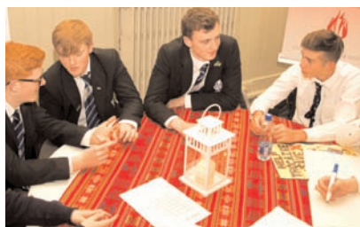
Students from the Irish Spiritan Schools work together in the Lecture Hall