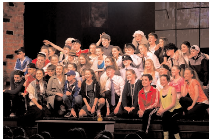
The Cast on the final night of 'Oliver Twisted'