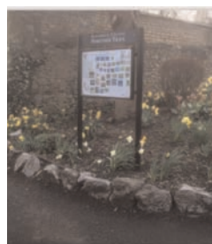
Observing Birdlife in the Campus

biodiversity sites, nest box scheme, tree trail, bird feeding stations, holocaust memorial garden, brimstone butterfly project, bird survey, dendrochronology project and nature walks.