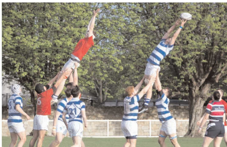
House 2nds V Castle 2nds

The Castle Seconds lost to the House Seconds on the SCT pitch in what was a fantastic game. We wish the House Team well in the final against St Michael's. The Castle Thirds bowed out during the group stages of their competition having lost narrowly to St Mary's.