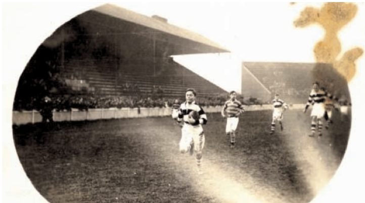
15 year-old Kevin Barry playing for his school, Belvedere College, in the 1917 Leinster Schools' Junior Cup

The SCT and JCT both met Belvedere in their finals. The seniors won but the juniors lost to Belvedere whose team included 15-year old Kevin Barry, hanged in Dublin three years later by the British for his part in the War of Independence as a member of the IRA and remembered in the song named after him as "just a lad of eighteen summers".