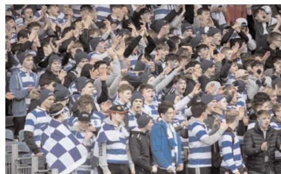
Blackrock College supporters