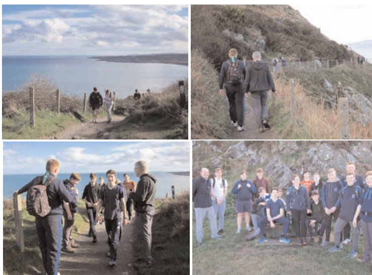
Practice for The Camino – Bray to Greystones