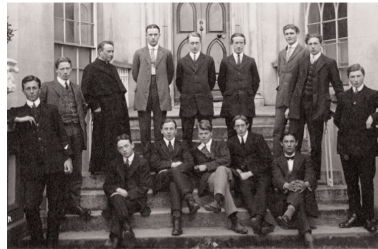
Elegant Castle students