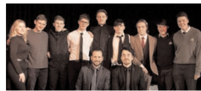
The cast, crew, writers and directors of Tear up the Ground .