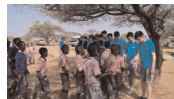
A warm welcome for the Blackrock students at Nado Enterit Primary School