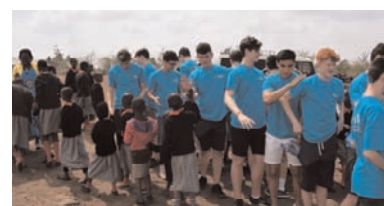
Transition Year students are welcomed to the Enkereyan Primary School in Kajaiido County

from the off once we had the initial meeting in Leopardstown back in February. From there students were involved in all elements of planning and organising the race, getting experience in events' management, problem solving, engaging with sponsors and media with national renown. Thankfully all their efforts were reflected on the day, as the race went off without a glitch. The weather was fantastic and the atmosphere in Leopardstown even better. Well done to all involved. They have given so much, hopefully learned so much and most importantly raised substantial funds for such a worthy cause.