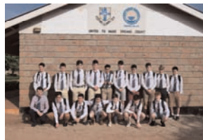
First day in school in Machakos and time for a quick photo before class

from the off once we had the initial meeting in Leopardstown back in February. From there students were involved in all elements of planning and organising the race, getting experience in events' management, problem solving, engaging with sponsors and media with national renown. Thankfully all their efforts were reflected on the day, as the race went off without a glitch. The weather was fantastic and the atmosphere in Leopardstown even better. Well done to all involved. They have given so much, hopefully learned so much and most importantly raised substantial funds for such a worthy cause.