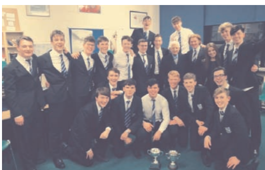
Libermann Choir (winners of the choir competitions at the Wesley Feis)