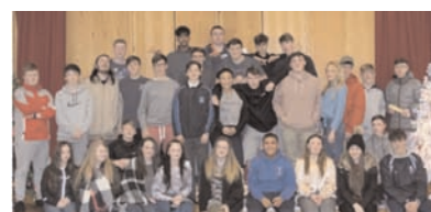
The Black Swan Music Programme

This weekly programme sees the seven TY students, along with their inner city counterparts, explore issues of class and its effects on young people growing up in Ireland today, through the medium of music and song writing. Singing and playing from a barge on the canal, the various cross-class bands performed songs throughout the evening of April 1st, creating a wonderful atmosphere on Charleville Mall which had been closed to traffic and turned into an inner city street festival for the occasion.