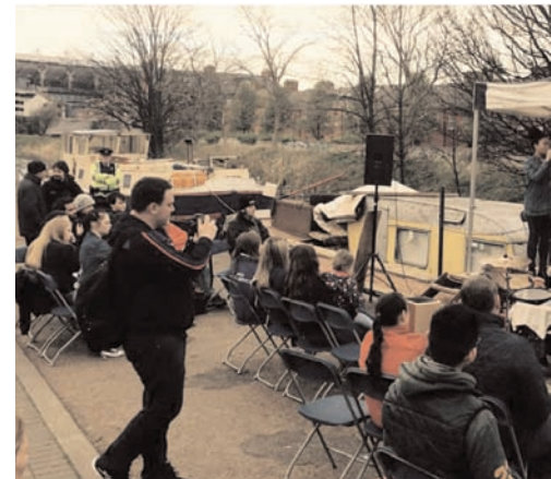
Blackrock Swan Youth Development Programme performing on a barge in the canal as part of the Five Lamps Arts' Festival