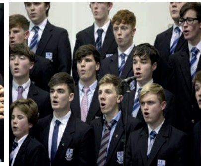
Members of the choir perform at the Carol Service

Remarkably, despite past success, music and drama in the school keeps growing and thriving. Blackrock can proudly look to the performing arts as a keystone in our cultural landscape.