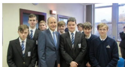
Members of the News Team with Micheál Martin after his live interview on BCR.