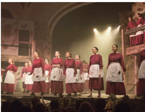
Mount Anville girls performing in Les Misérables