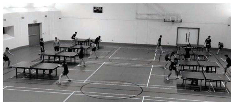
Members of the Table Tennis Squad in action in the Sports Hall