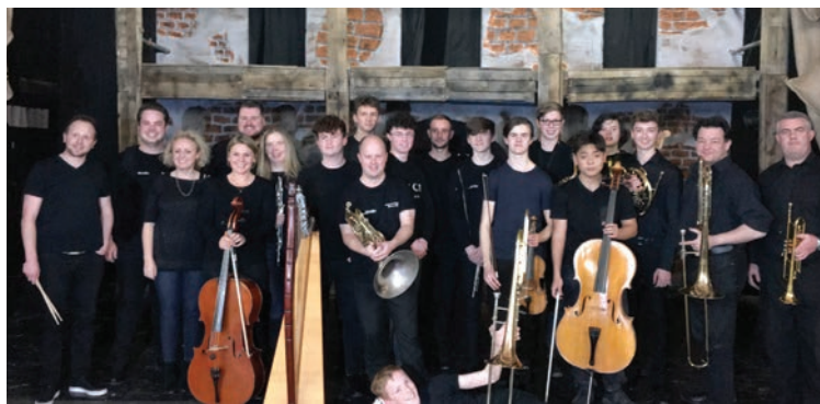
Members of the Orchestra who played at Les Misérables