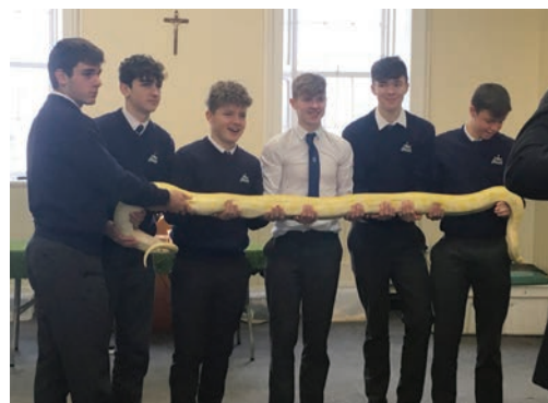
Tony the Python having a good relaxing stretch with some of his new friends from 4th Year.