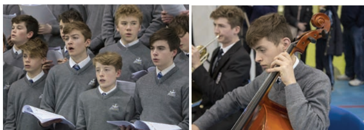
Third Years and Second Years singing in the choir at the Carol Service