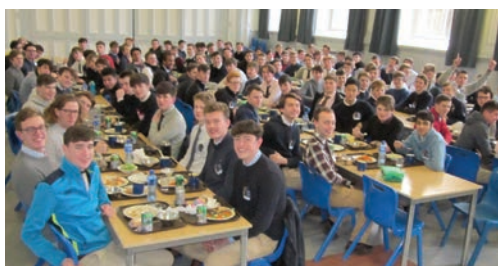
119 members of the class of 2018 completed the fast for the SVDP