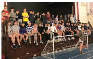
TY students at the Soccer Marathon in aid of St Vincent de Paul

The frost on the ground or the wind chill could not curtail the energy or enthusiasm as 122 Transitions Years who took to the pitches on Friday 1st December. We were blessed really with the weather and by lunch time the sun was out. Credit must go to our soccer marathon coordinators who organised a seamless event. It was a great event and well done to the lads who participated in such an enthusiastic way. It all seems very straight forward at 9am but there were certainly some heavy eyes on show from about 8pm! Despite all this pizzas were devoured in record time. This was preceded by the students getting schooled once again by our staff all-star team! But of course the end result of this fantastic fundraiser is the money raised which goes directly towards the SVP hampers.