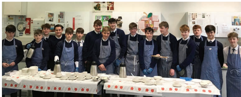
Transition Years who ran the Mince Pie Morning in aid of Saint Vincent de Paul