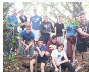
6th Year Retreat Kiltegan 2014

In conclusion, it is important to note that it is the participation by teachers, from many different departments, in the Pastoral Programme that makes all of the above events possible. For example, the 6th Year Retreats could not happen without the 15 teachers who volunteer to travel with the students for three days and two nights and without the support of their colleagues who cover class while they are away. Teachers in the College also lead reconciliation services, prepare students for ministry and attend family masses on a Sunday morning in a generous spirit of goodwill and demonstrating a real enthusiasm for faith development. How fortunate we are in our teachers.