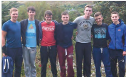
Rostrevor 6th Year Retreat group