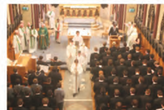
Boarders' Family Mass