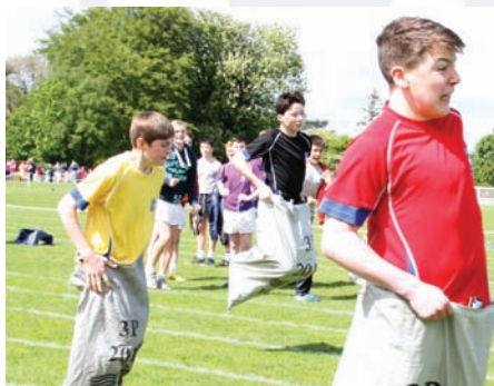
Third Year Sack Race on Sports Day

The senior cricket season saw Blackrock drawn in a pool against Dundalk, CUS and St Andrews. The season started off with a comprehensive win against Dundalk. Batting first,