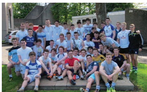
Karl Ashe Gaelic Final 2014

The Karl Ashe Memorial Cup was fiercely contested again this year, with a 5th year Dayboys team and a 5th year Boarders team representing the year. The 5th year Dayboys were narrowly beaten by the 6th year Dayboys in the first semi-final, and the 5th year Boarders fell short against their 6th year counterparts in the second semi-final.