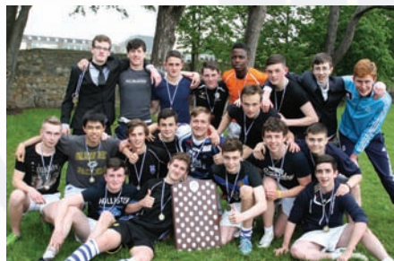
Stanley Cup winning team