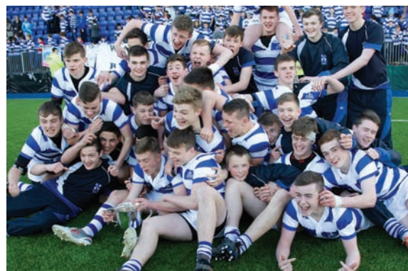
Jubilant JCT squad after their cup win