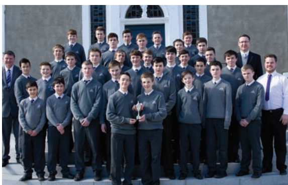
The Corless Choir, winners of the Epworth Cup at Wesley Music Festival

A lot of good work has taken place since the return in the second week of Lent. With the introduction of the cashless payment system in the Dining Hall and the Secretariat we would urge parents to insist on their sons' using a wallet in order to reduce the loss of cash and damage to/loss of cards. The new system has many merits including much greater efficiency when paying in the Dining Hall and the opportunity to borrow books in the Creative Arts and Digital Learning Centre, however taking greater responsibility for cards is imperative.